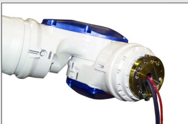
THRU-ARM CABLE AND HOSE ROUTING